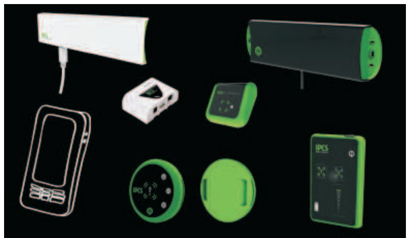
WanderFree system components

Central equipment requires 4 x power outlets and access to a data network.